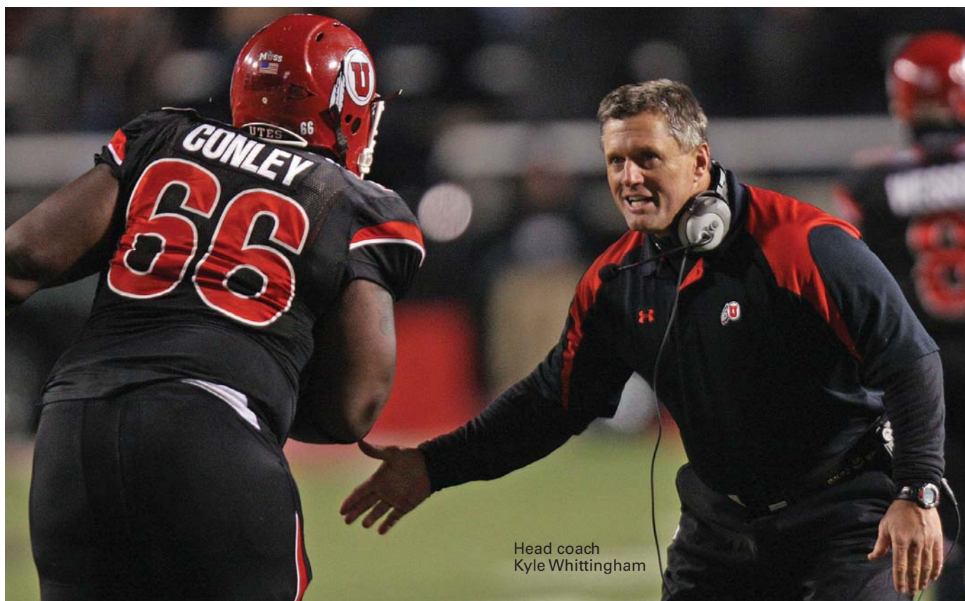
Head coach Kyle Whittingham